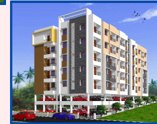
Sagar's Xia, SAGAR HILLS