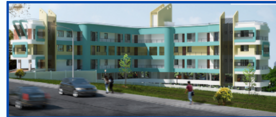
Sagar's Pulamar, BEJAI