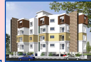
Sagar's Disha, JEPPU