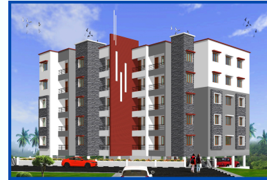
Sagar's Cira, SAGAR HILLS